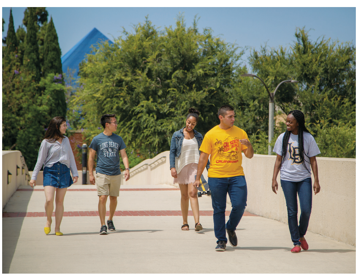
Students near the CSULB Pyramid