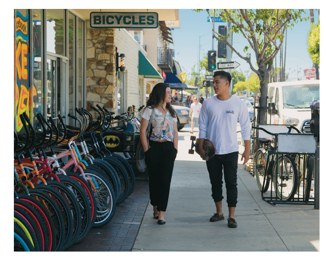
Students in Belmont Shore, a popular dining and shopping area

Apply today at cpie.csulb.edu/StudyAbroadAtTheBeach