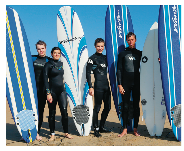
Students surfing at a local beach